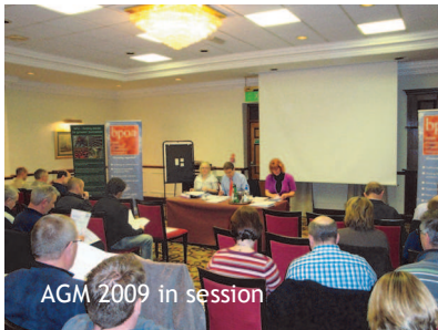
AGM 2009 in session

For further details on Hellidon Lakes log on to www.QHotels.co.uk